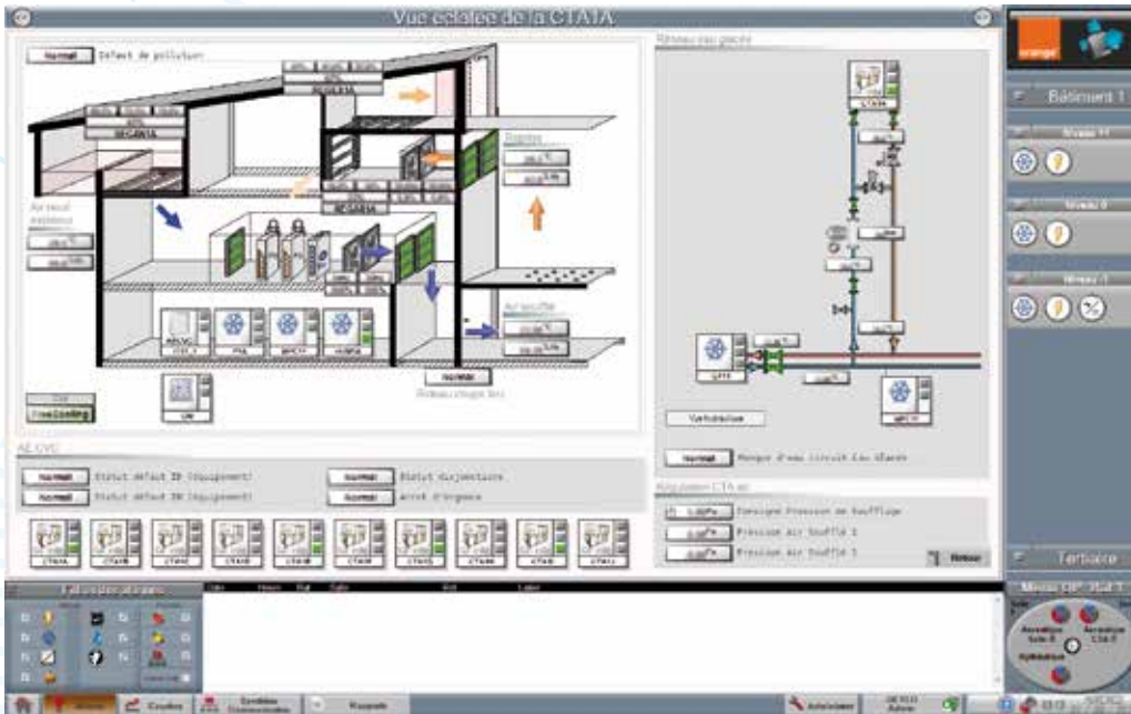
Managing the central air-handling system