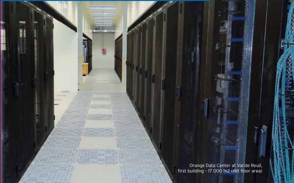
Orange Data Center at Val de Reuil, first building - 17 000 m 2 (net floor area)